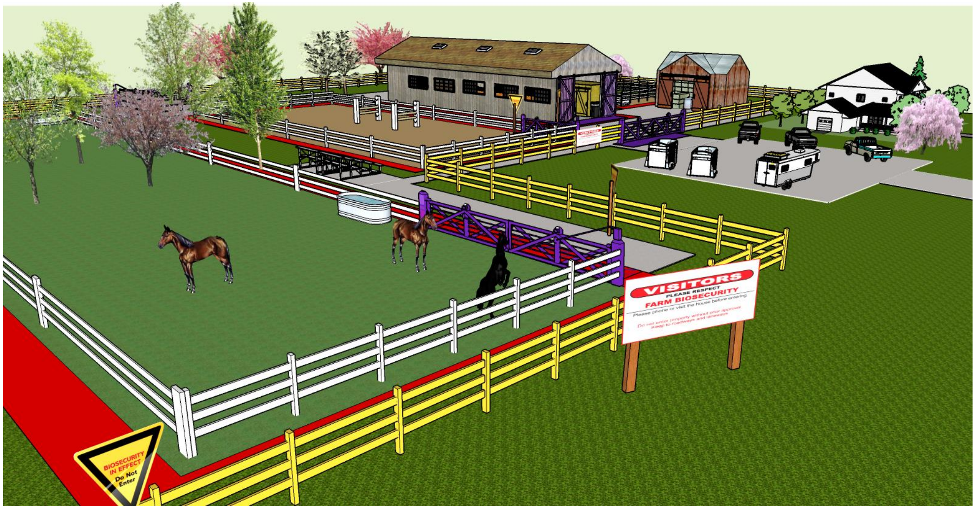
Figure 3: Zoning on a Horse Facility: A simple horse facility demonstrating the concept of two biosecurity zones. The controlled access zone (yellow fenced area) establishes a boundary between everything outside the facility and areas of the property involved in horse care and management. It provides the ability to manage the risks of the introduction of disease into areas where it may be easily transferred to horses and reduce the spread of disease off of the property. Storage areas for feed, bedding and manure and bleachers for viewing the arena are located in this zone. Restricted access zones (areas bounded in red) require stricter biosecurity and limit direct access to horses or the areas that they may reside. Controlled access points (purple gates) and signage assist in managing and directing traffic flow into and out of the controlled and restricted access zones. Parking for visitors is established outside the controlled access zone and a separate driveway and parking area is established for the property owner's house.