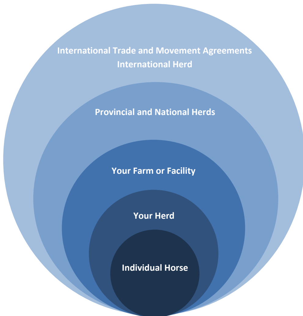
Figure 1: Your Horse – Part of a Larger Herd This diagram illustrates the relationship of an individual horse to the national and international horse industry. It emphasizes the impact that disease left uncontrolled from an individual horse can have on the horse industry in Canada. Modified from Equine Biosecurity Principles and Best Practices: Disease Transmission ; Government of Alberta.

Disease control and prevention is complex. This complexity is compounded by the inherent biosecurity challenges in the equine industry, including: