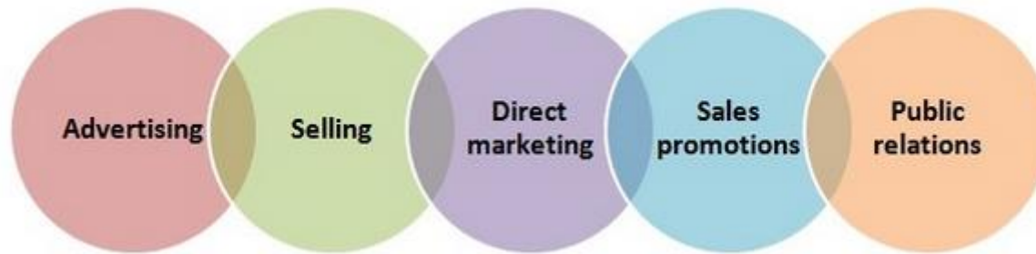
The Marketing Plan – Communication Mix