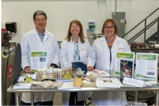
BPIC has a uniquely integrated team of scientists, engineers and industry development professionals.