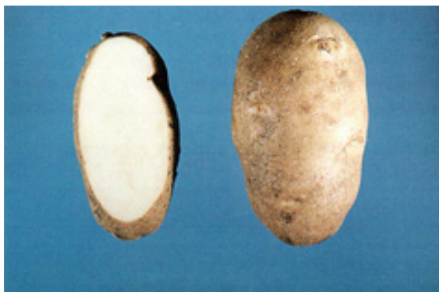
Figure 1: Russet Burbank – a quality gem

Over the past two decades, Alberta has developed an excellent reputation for producing high quality, healthy seed potato stocks (Figure 1). Annual losses from bacterial ring rot (BRR) in our commercial potatoes are minimal or non-existent.