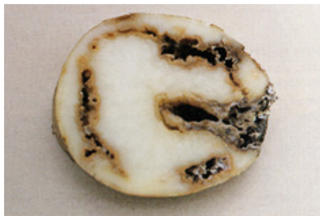
Figure 2: A ring of bacterial ooze

(Figure 2) contains millions of pathogenic bacteria. This ooze can be diluted a million times and still infect healthy, susceptible potatoes. One infected tuber passing through a seed cutter can infect hundreds of healthy tuber pieces.