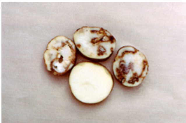
Figure 4. Norchip is highly susceptible to ring rot