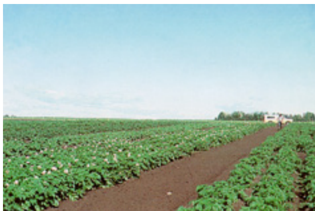
Figure 5: Northern vigour – seed potato production in Alberta

Alberta's seed potato industry has an excellent reputation as a leader in high quality, disease-free production (Figure 5). We all need to work together to keep it that way.