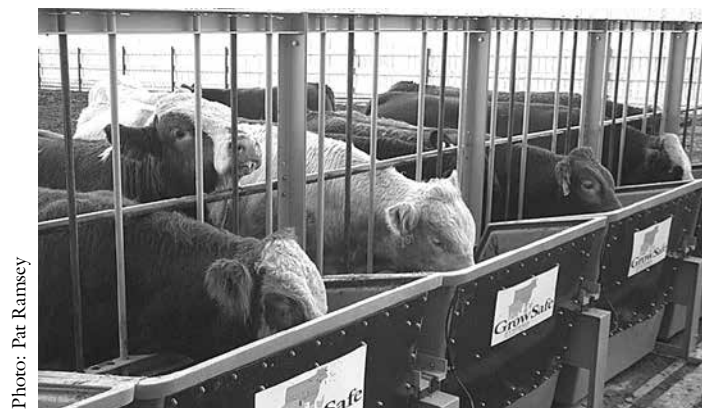
Figure 3. GrowSafe System used for measuring RFI of bulls at Olds College.