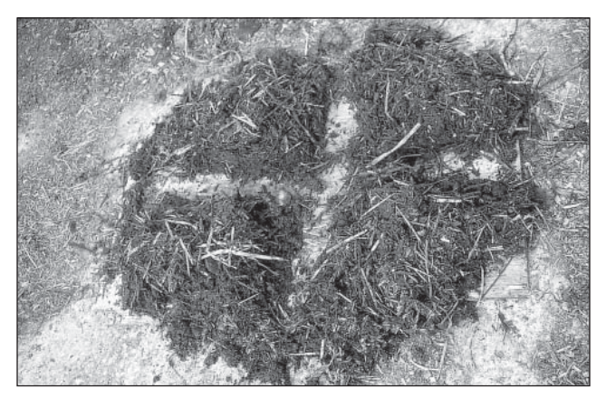
Figure 1. Dividing a pile manure into four sections

Alternatively, manure can be collected during field application. To do this, place a minimum of three tarps,