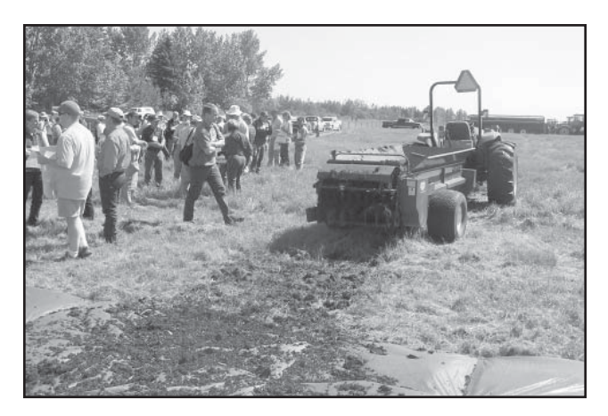
Figure 2. Collecting manure with a tarp

with more recommended for very large areas, across the field, so the tarps can catch the manure from several applicator passes. Collect samples from the entire application process. Although messy, this method of collection can provide a real estimate of the nitrogen applied after handling and application volatilization losses have occurred.