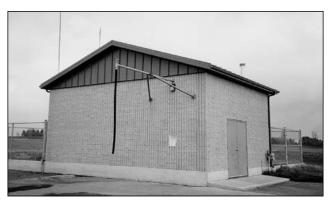
Figure 5. Tank loading facilities

Many farmers have tried unsuccessfully to solve all water supply problems on their own farms. Group projects may be a better alternative.