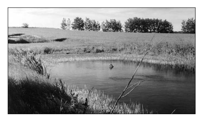
Figure 1. Water is essential

Water is essential to all human activity (Figure 1). The way water resources are managed will determine the future of the prairie economy. Security of water supply has been a primary goal of Canada/Alberta cost-share programs since the drought in 2000. The latest program suite is called the