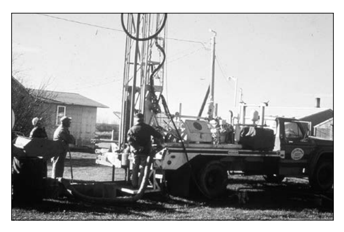
Figure 6. Test drilling to locate groundwater aquifers

In many areas, municipalities have also been involved in groundwater test drilling programs to locate significant groundwater aquifers in water shortage areas (Figure 6). These higher producing aquifers can become excellent locations for tank loading facilities or regional pipelines.