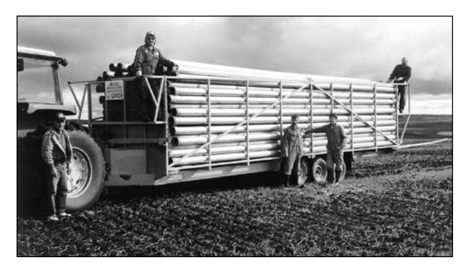
Figure 2. Water pumping program

Truck in water or pump from another water source.