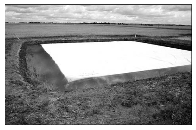
Figure 4. Plastic cover to reduce dugout evaporation losses