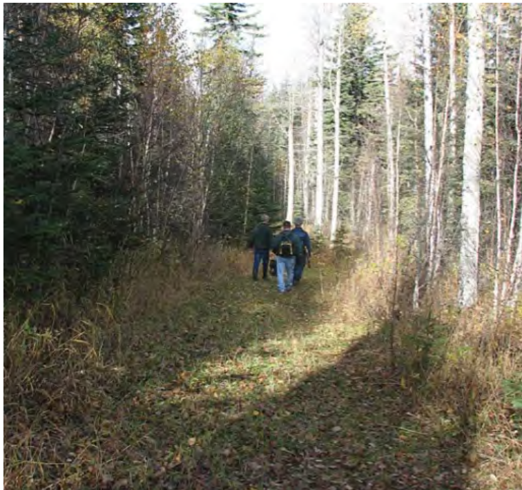
Recreational trail

Construction of roads, trails and waterway crossings in a woodlot are potentially ecologically disruptive activities. Roads and trails leave a permanent mark on the landscape and waterways may be directly affected. However work can be planned and conducted to minimize these impacts and contribute to a sustainably managed woodlot.