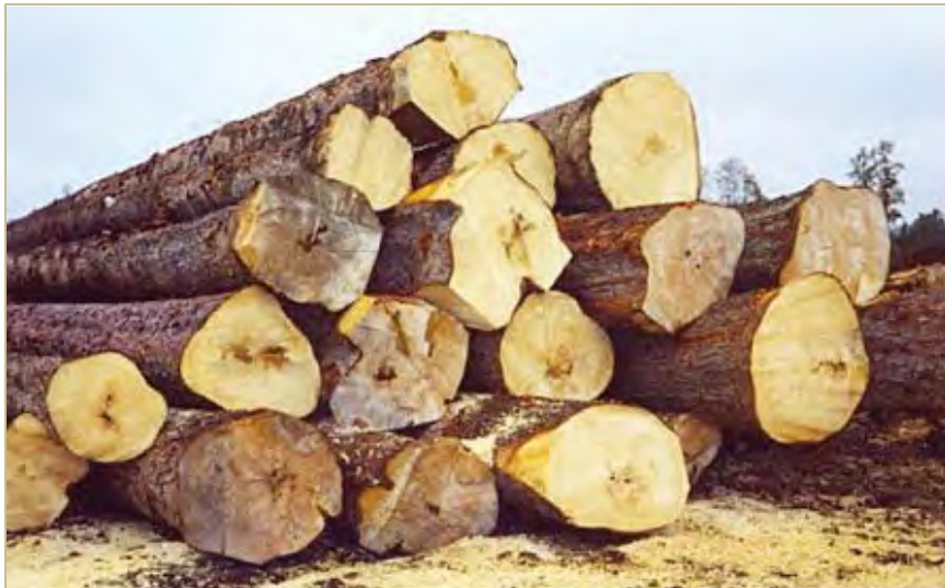
White spruce logs