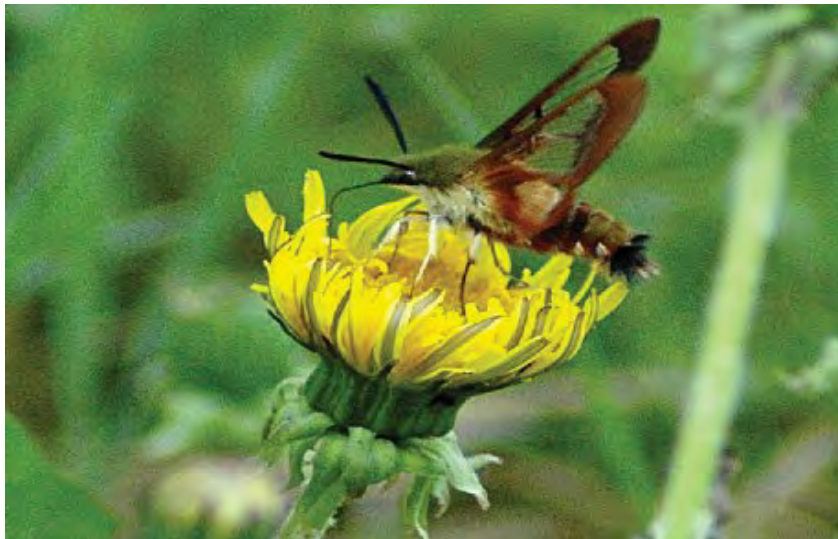
Hummingbird moth nectaring at a dandelion near Peace River