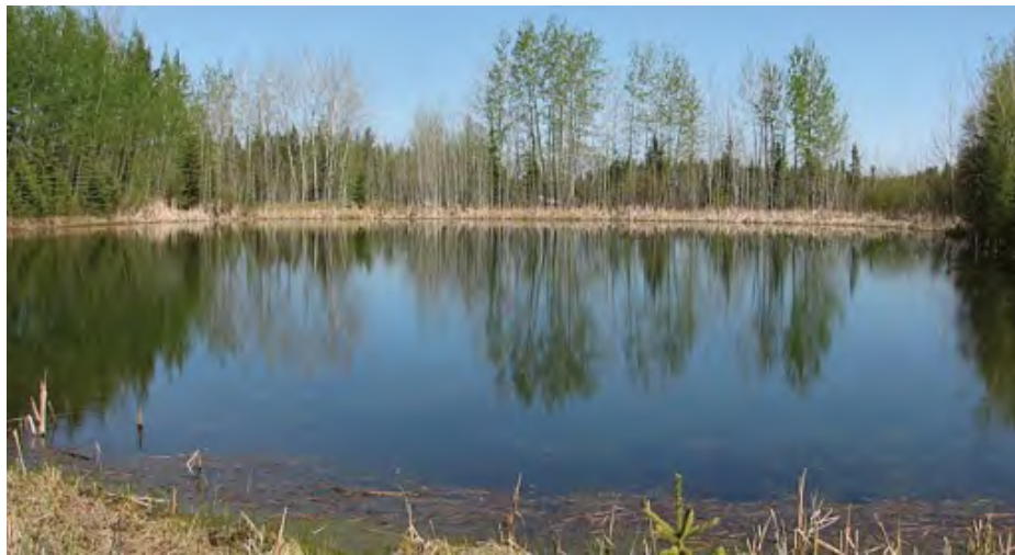
Wetland surrounded by woodlots

Riparian areas, which can contain forbs, willows and trees, extend beyond the perimeter of the wetland and provide extra stability to the whole wetland system. The additional layers of vegetation that thrive in riparian zones ensure the wetland continues to function at its best and to provide its many benefits.