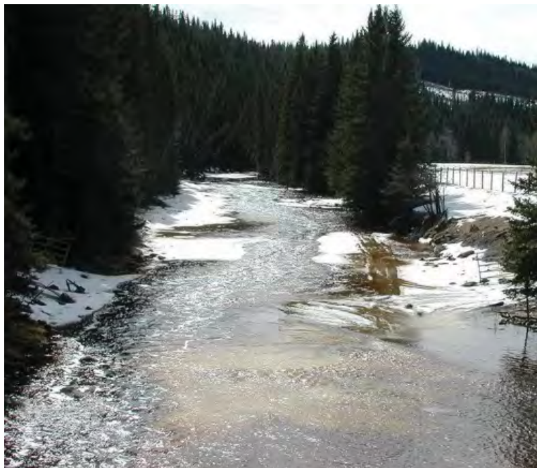
Creek and buffer