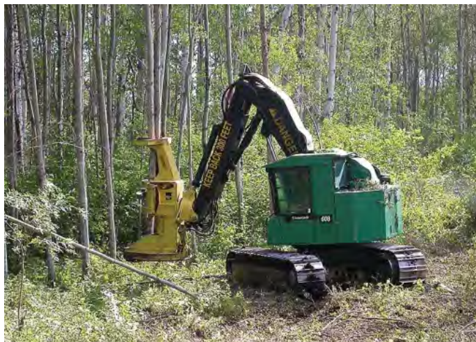
Tree harvesting

Harvesting timber is a costly but important woodlot activity. Although realizing a financial return is a major reason to harvest timber, changing species composition, removing damaged or diseased trees, or improving the quality and future value of the stand are also legitimate reasons for harvesting. Whatever the reason, the operation should be planned carefully to optimize the yield and to accommodate numerous