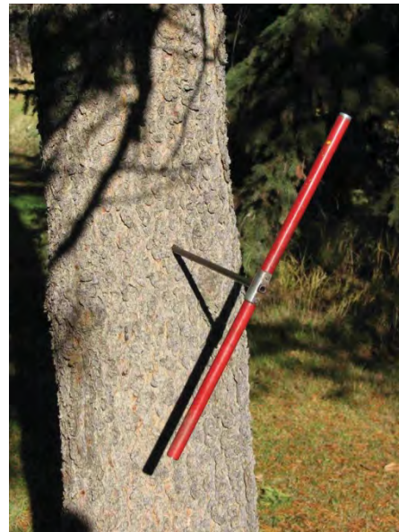
Using increment borer to determine the age