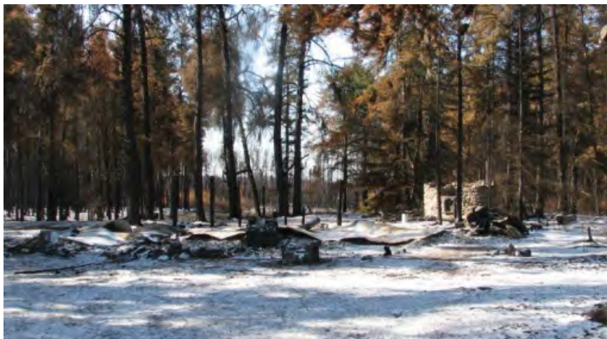
Burnt house and forest area