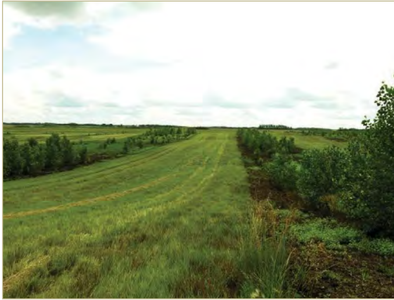
Alley cropping in northeastern Alberta