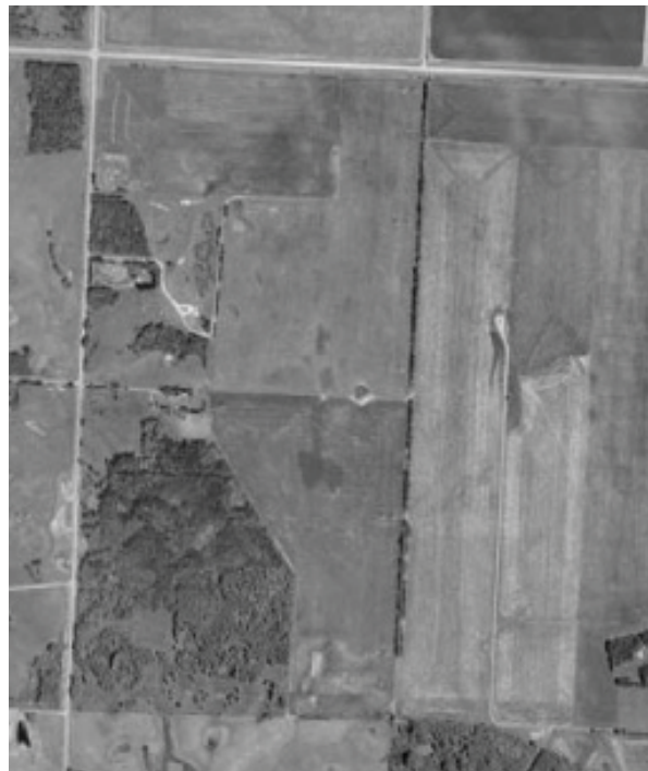
Aerial photograph of a section of land