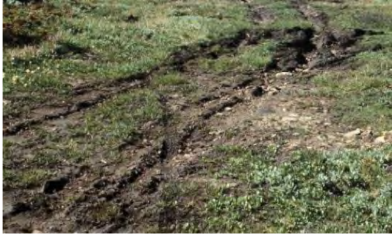
Soil rutting destroys soil structure and changes soil drainage patterns.