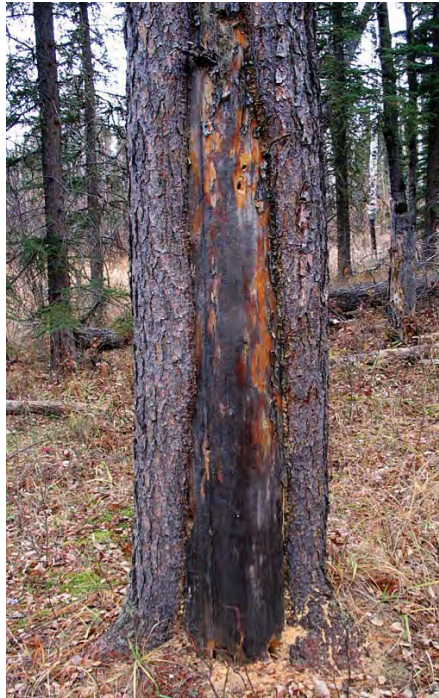
Wood boring beetle damage and fire scarring