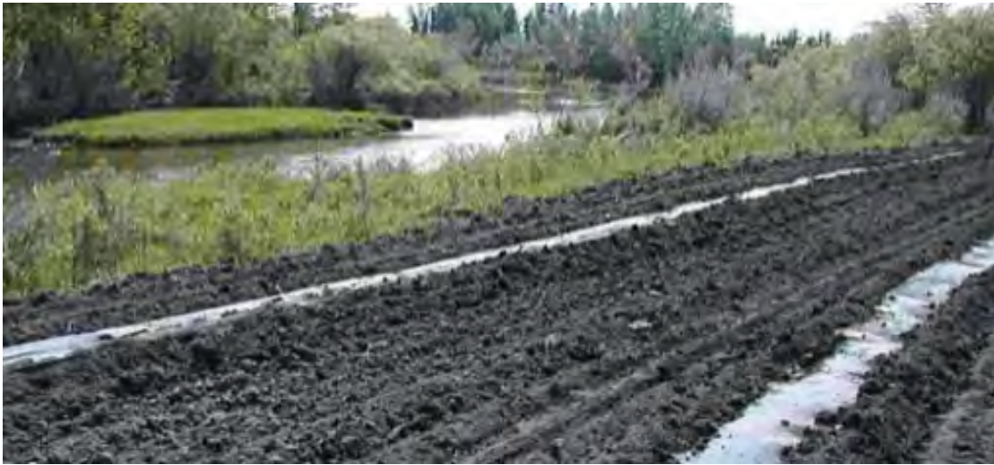
Tree planting along the river