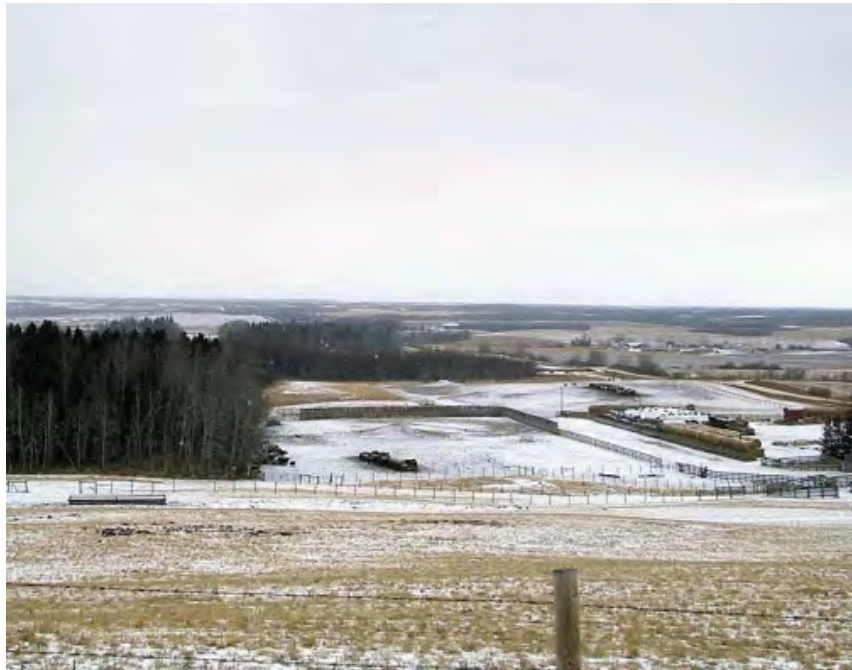
Woodlots protect feedlots from wind