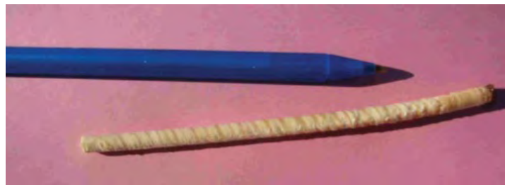
Tree core

It is important to collect and assemble woodlot resource information needed to develop a practical plan for the woodlot.