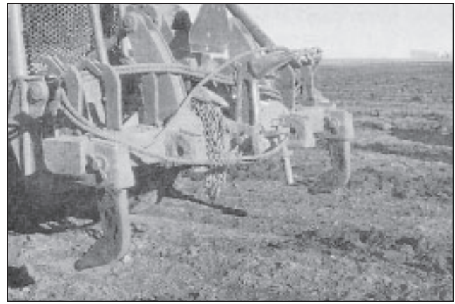
Figure 8. Subsoiler ripping points

Work at right angles to the prevailing wind. Where possible, the ridges should also be at right angles to the slope of the field to reduce the risk of water erosion.