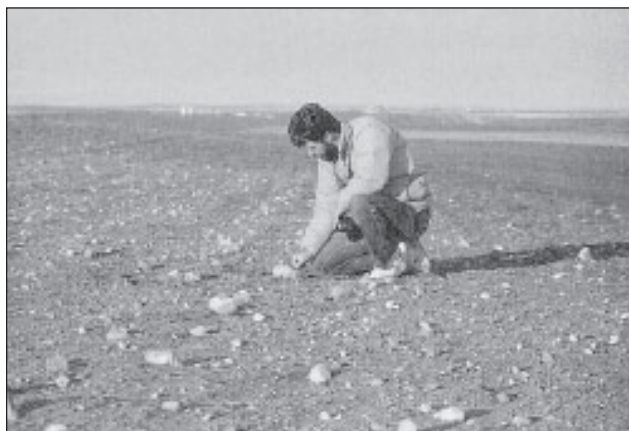
Figure 2. Wind erosion removes smaller particles