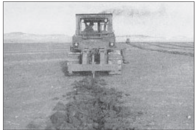
Figure 9. Ripping produces cloddy ridges in frozen soil.

Till deep enough to create ridges at least 4 inches (10 cm) high. The spacing between ridges should be about 6 to 30 feet (1.8 to 9 m). Use the narrower spacing if the field has a history of wind erosion.