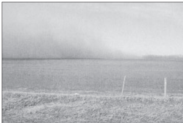
Figure 1. Wind erosion reduces soil productivity.

When soil can be seen drifting (Figure 1), at least 4 or 5 tons of soil per acre (9 to 11 tonnes/ha) are being lost each day. For each inch of topsoil lost to wind erosion, crop yields are lowered by several bushels per acre. Wind erosion removes soil nutrients, smaller soil particles and organic matter, making the eroded field less productive (Figure 2). Wind erosion can harm air quality and can reduce water quality if eroded particles drift into streams and lakes. Certain herbicides remain with the soil even when transported by wind and may affect crop growth where soil drift is deposited.