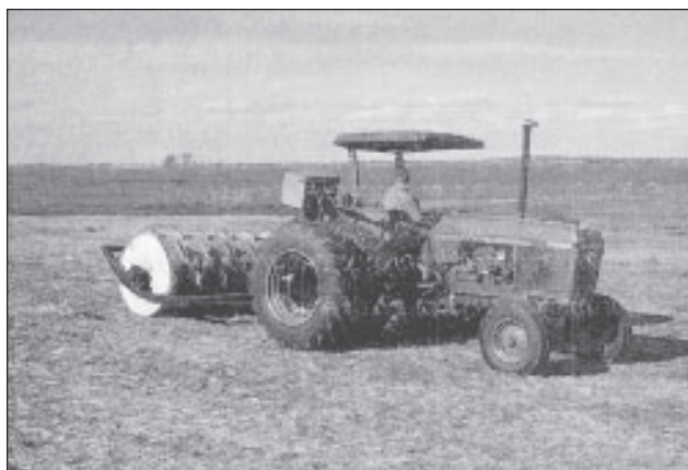
Figure 3. A straw crimper can be used to anchor straw.

Apply and anchor straw in the soil. Longer straw is preferred to well chopped, short straw. Straw can be anchored with light disking or can be hairpinned into the ground with a weighted double disk drill (no packer). Some municipalities have access to a straw crimper, designed especially to anchor the straw (Figure 3).