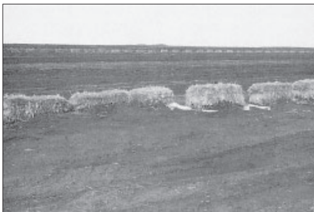
Figure 4. Rows of bales are set up at right angles to the wind.

Set up rows of small, rectangular straw bales at right angles to the prevailing wind (Figure 4). The rows should be about 30 to 50 feet (9 to 15 m) apart.