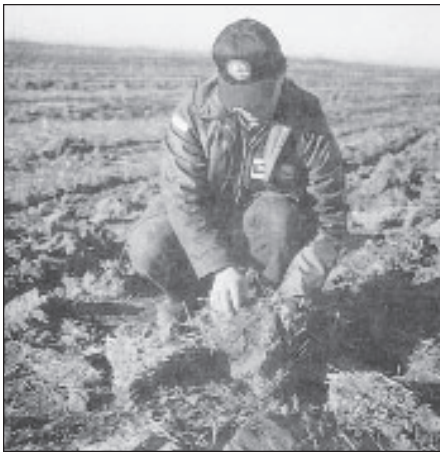
Figure 7. Clods in loam soils usually resist breakdown.