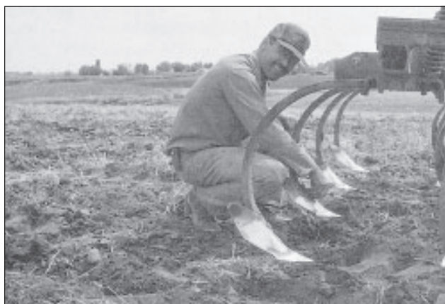
Figure 6. Lister shovels

Ridges should be 4 to 8 inches (10 to 20 cm) high. Ridge width should be about four times the ridge height. For example, if the ridges are 4 inches high, they should be about 16 inches (40 cm) wide.