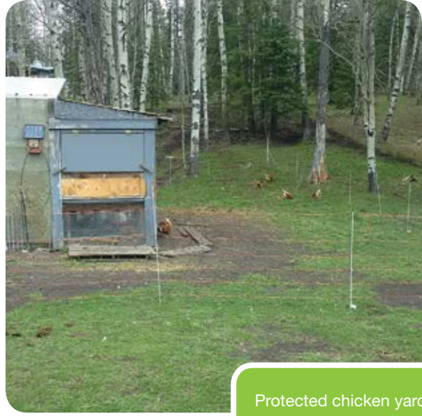
Protected chicken yard with electric fencing

Resources available for chicken producers – Current programs within Alberta Environment and Parks (AEP) can help chicken owners reduce chances of negative encounters with bears. On a case-by-case basis, AEP will loan electric fence kits to landowners who are experiencing bear problems. Call your local AEP office to determine if this program exists in your area. For additional information on how to prevent interactions with bears or other wildlife, please visit Alberta BearSmart at www.bearsmart.alberta.ca . For any conflicts with bears call Report-A-Poacher at 1-800-642-3800.