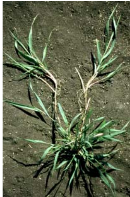
Figure 1. Quack grass with rhizomes and secondary plants

Quack grass can reproduce by seed and vegetative rhizomes (Figure 1). Seedlings are frequently purple/brown with a hairy leaf sheath. New seedlings are weak competitors. At the 4- to 6-leaf stage, seedlings begin to produce tillers. At the 6- to 8-leaf stage, rhizome production begins. The mature plant can be 2.5 to 4.0 feet (0.75 to 1.2 m) tall.