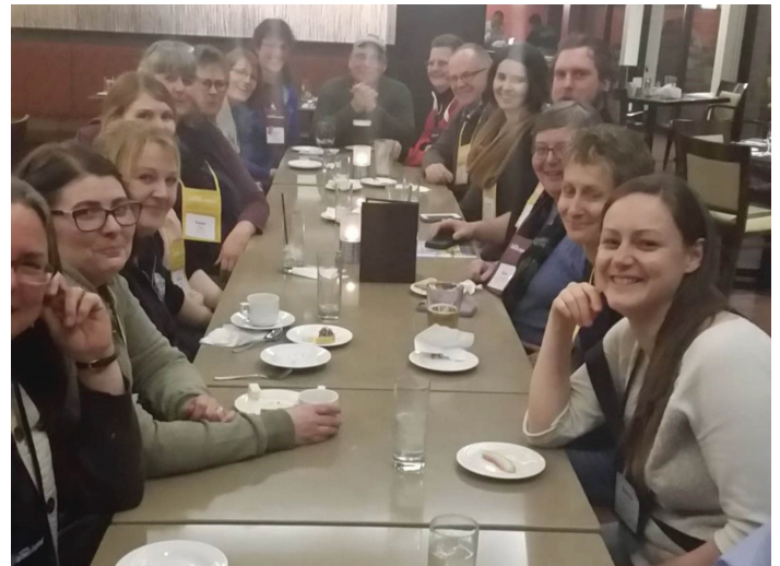
The Alberta attendees take a bus tour break.

The Convention, held in February 2016, consisted of a bus tour that guided participants through various agri-businesses in the